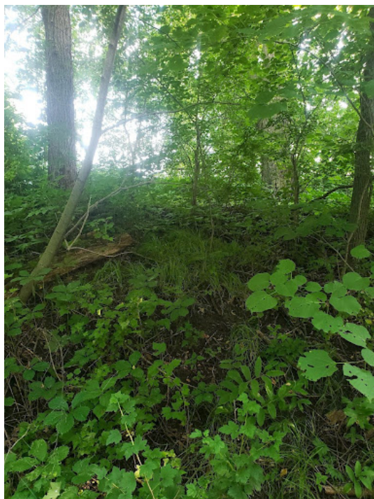
Above: Sedges in their native environment.

I intend to plant some Canada Anemones, Spotted Bee Balms ( Monarda punctata ), Pussy Toes ( Antennaria plantaginifolia ) and Raydon's Favorite Asters this weekend. They will be planted beneath Hackberries, Red Cedars and Black Walnuts on a steep, south-facing slope. I hope I'm not sentencing them to death, but I have to test my latest theories. Erosion control is one of my goals, although our trees hold the slope quite nicely. Establishment of native plants is another, since our lakeshore is home to numerous furballs and feathered friends. The group I've chosen must endure: heat, drought, wind, shade, competition and juglone. I'll let you know how it goes!