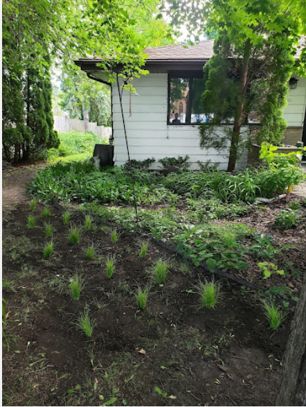
Above: Carex pensylvanica experiment in my yard.