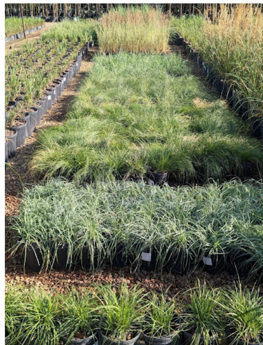
Above: Carex flacca , Carex rosea and others at the nursery.